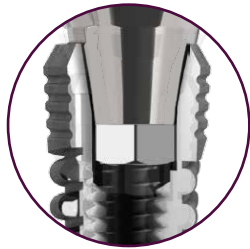
CONICAL HEX CONNECTION